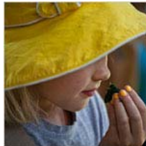
New York Moves to Stop Foraging in City's Parks