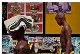
Slide Show A Day of Relentless Heat