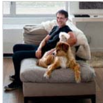
Finding a Neighborhood for a Man and His Dog