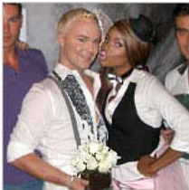
The A-List? They Must Be Grading on a Curve