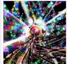
Child of Eden: A Sensory Trip to Paradise